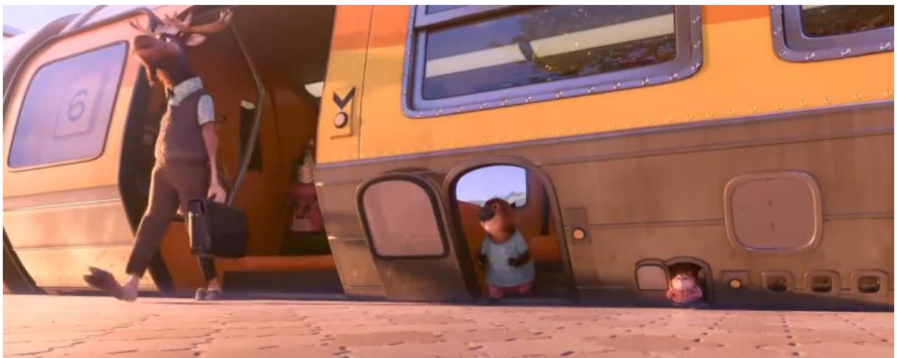
Different train doors catered for different size mammals

Although the concept of inclusiveness embraces everyone in society, there is a need to understand that it must not generalise everyone's need. Instead, different people's requirements should be considered when designing public and private facilities. A scene from Zootopia showed a train designed with three different sized doors for a reindeer; a brown bear and a rodent, instead of assuming that every mammal could use the medium sized door. This is very important since according to a 2013 report from the Asian Development Bank and Asia Pacific CoP-MfDR (Community of Practice on Management of Development Results) , more than 90% of facilities found in public spaces globally have generalised the needs of everyone, thus resulting in the neglect of citizens with special needs.