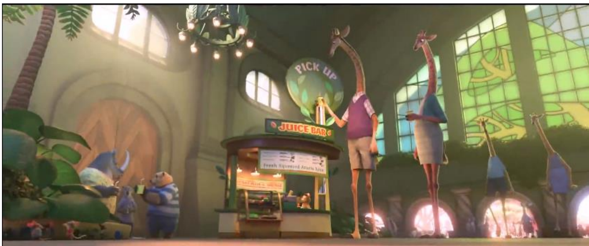
Pick up Juice Bar for mammals with different heights

In one scene in Zootopia it showed a juice bar designed for mammals of different heights and it reminds us that different facilities are designed for different groups considering our different physical and psychological states. It is a splendid demonstration of ' different people (animals), different needs '.