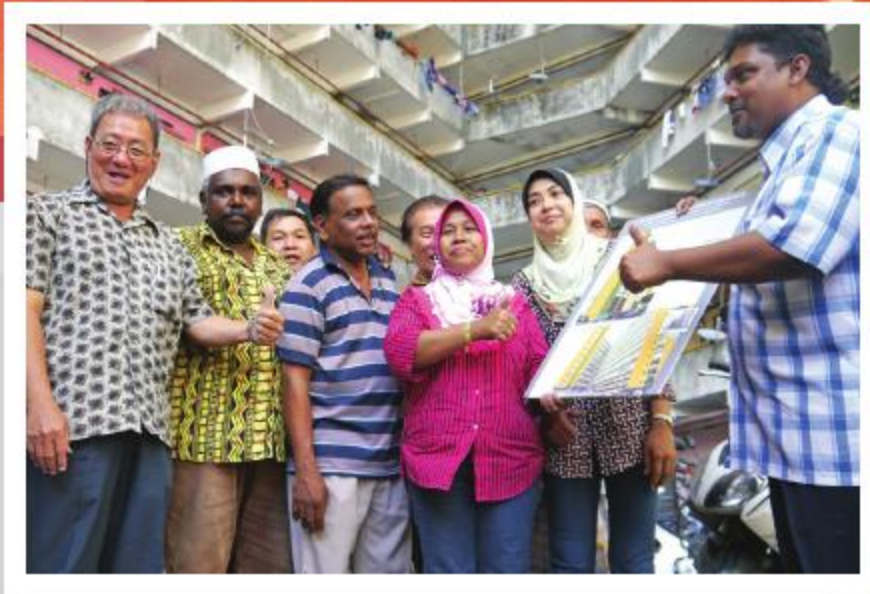
Repainting project at PPR Jalan Sungai.